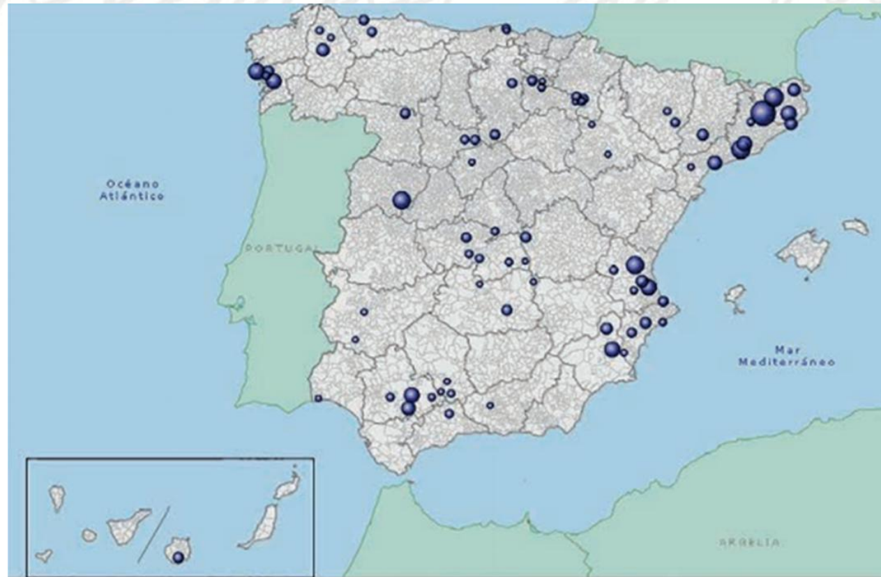
Figura 2. Clusters agroalimentarios relevantes (fase 2) según empleo. Fuente: SABI y elaboración propia. Nota: © Ministerio de Fomento ( http://atlasau.fomento.gob.es/ ) con datos propios.